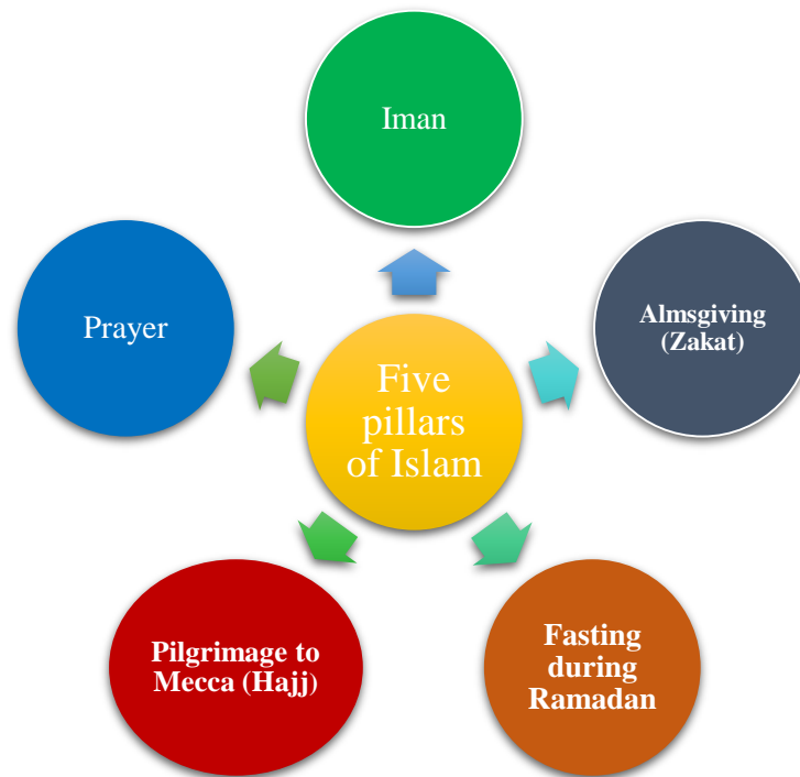
Figure 1: Five pillars of Islam

the highest regard. The cornerstones of their faith are iman, prayer, zakat, fasting during Ramadan and the Hajj (the journey to Mecca) (Figure 1). Each rite has profound spiritual meaning and fosters a sense of dedication and community among believers (Islam et al., 2018). The people in the examined area shared a number of habits, including the faithful attendance of daily prayers, the practice of almsgiving as an essential component of their faith, and the practice of fasting during the holy month of Ramadan. In addition, the Hajj, or pilgrimage to Mecca, is a significant event that symbolizes both a spiritual quest and an expression of devotion to Allah. These customs serve as a reminder of Islam's core values of justice, piety, and a close adherence to the Quran. Local communities observe the following established rites, which strengthen the bonds between individuals and their faith: